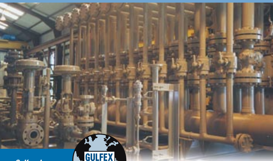
Above: Production manifold skid.