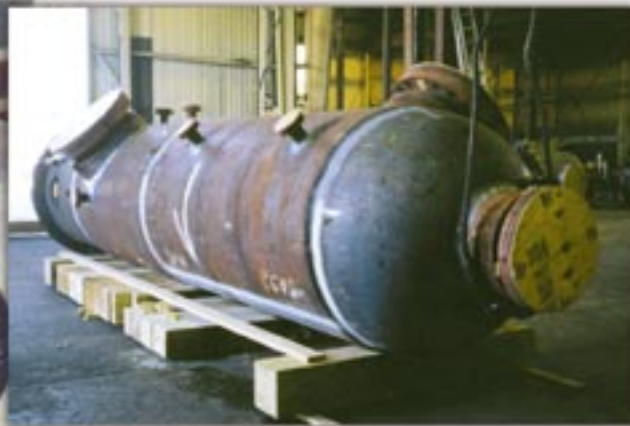
Bottom: High pressure separator for offshore platform in the North Sea. 3 3/4" thick, built in six weeks and air-freighted to Denmark via 747.