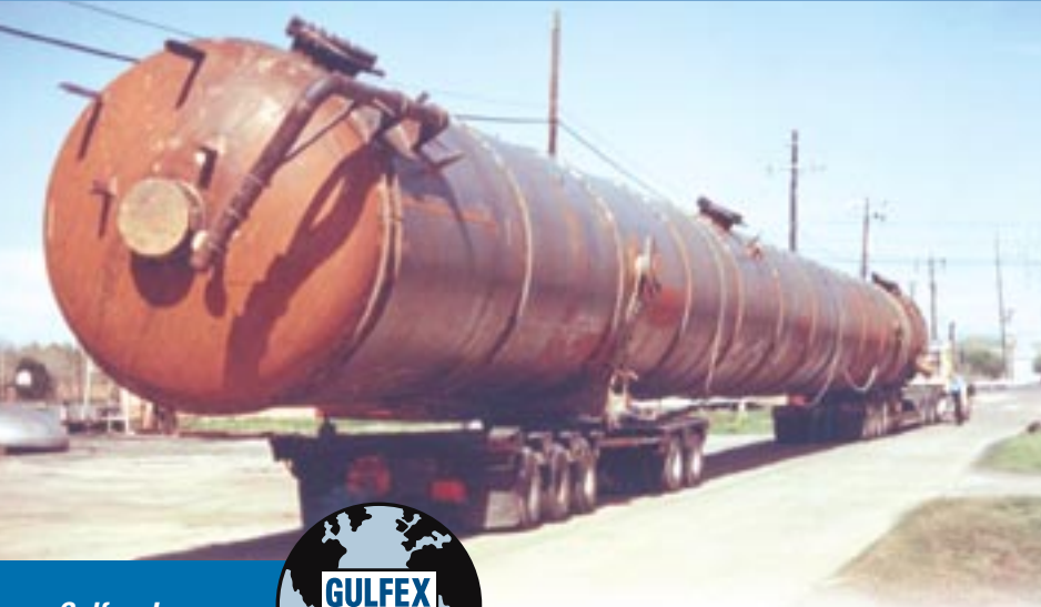
Bottom: 192" I.D. x 60' process drum for a Texas chemical plant.