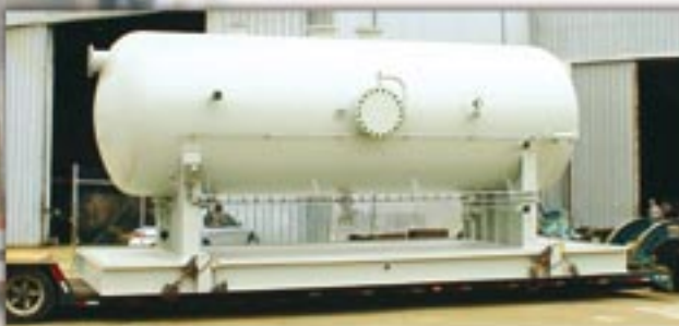
Middle: 108" I.D. x 24' long flare scrubber skids for offshore platform.