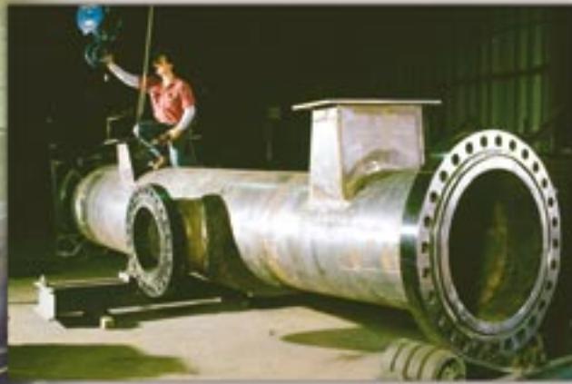
Far left: 30" diameter 1800 psig X-70 material slug catcher header for gas plant in Peru.