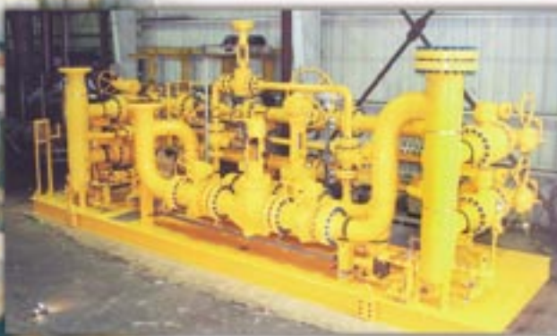
Bottom: High pressure gas metering skid for offshore platform.